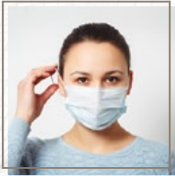
We All Need To Wear Masks

During the COVID-19 pandemic, the safety and well-being of our patients, staff and doctors is our first priority. Our team will continue to go above and beyond the expectations for optometry practices so that everyone who enters our practice will feel safe. We are sure that you are well aware of the concerns about COVID-19, and we would like you to know the steps we are taking. These measures include, but are not limited to: