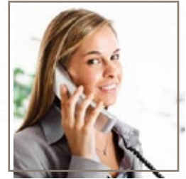
Call Us With Any Questions