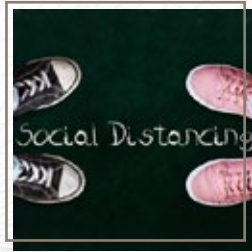
Practice Social Distancing